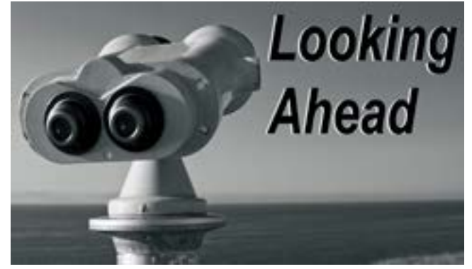
Outreach & Mission Opportunities for 2024